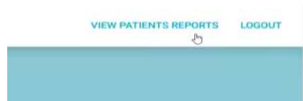
Fig 29 Click on View Patient Reports