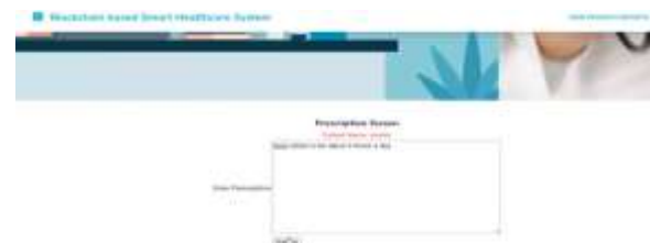
Fig 30 Prescription Screen