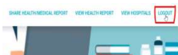
Fig 25 Click on Logout