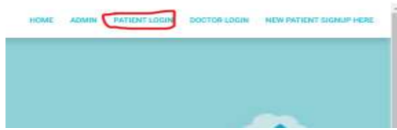
Fig 33 Patient Login