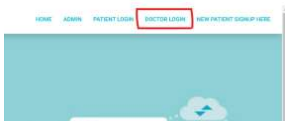
Fig 26 Click on Doctor Login