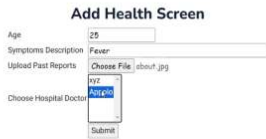
Fig 19 Choose Hospital Doctor and Then Click on Submit