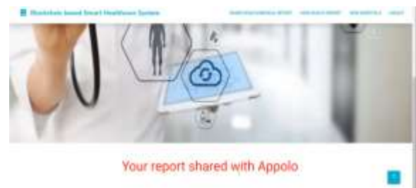
Fig 20 Output Screen