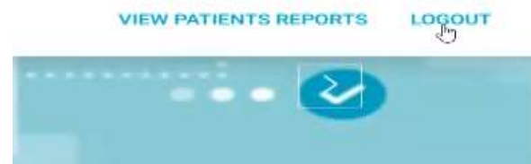
Fig 32 Click on Logout