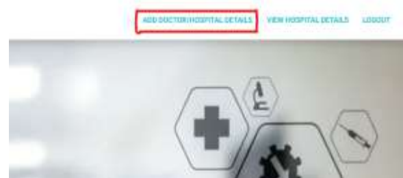
Fig 5 Click on Add Doctor/Hospital Details