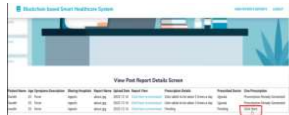
Fig 28 Output Screen