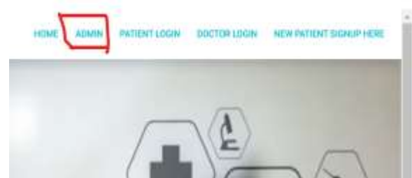
Fig 3 Click on Admin