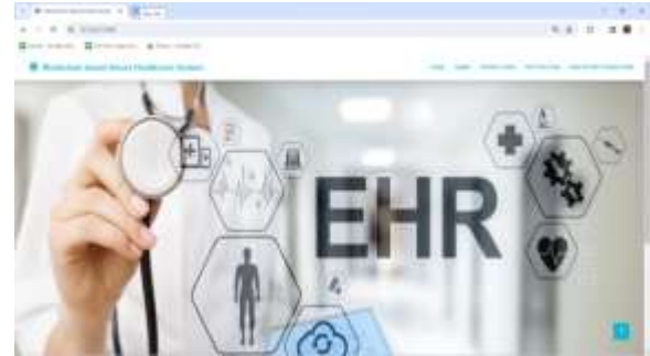
Fig 2 Home Page