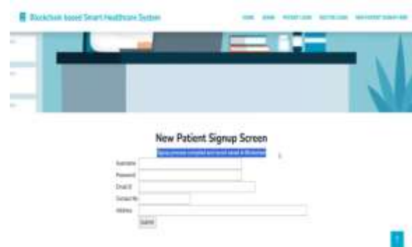
Fig 13 Output Screen