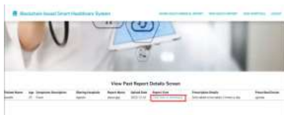
Fig 35 View past Report Details Screen

Click on “Click Here to Download” to download the Report