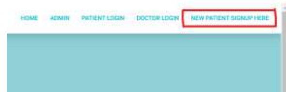
Fig 11 Click on New Patient Signup Here