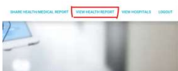
Fig 23 Click on View Health Report