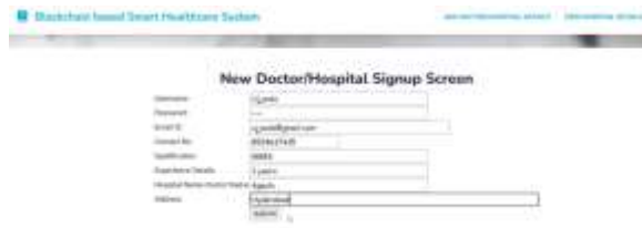
Fig 6 New Doctor/Hospital Signup Screen