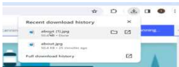
Fig 36 Output Screen

Click on “Click Here to Download” to download the Report