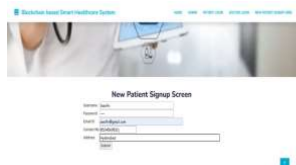
Fig 12 New Patient Signup Screen