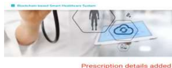
Fig 31 Output Screen