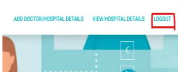
Fig 10 Click on Logout