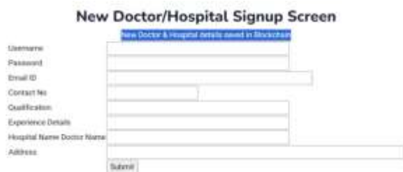
Fig 7 Output Screen