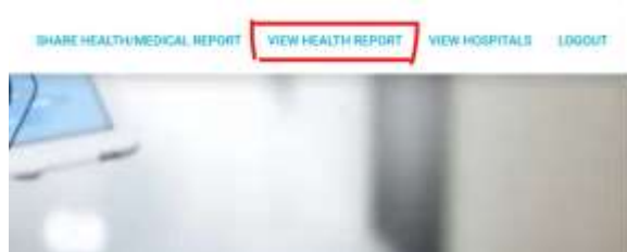
Fig 34 Click on View Health Report