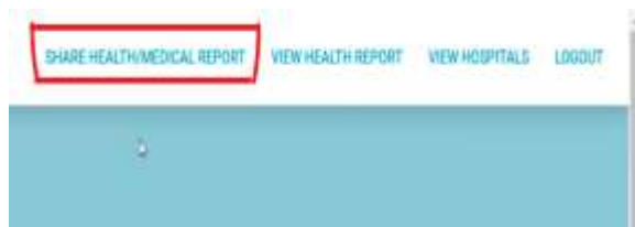
Fig 16 Click on Share Health/Medical Report