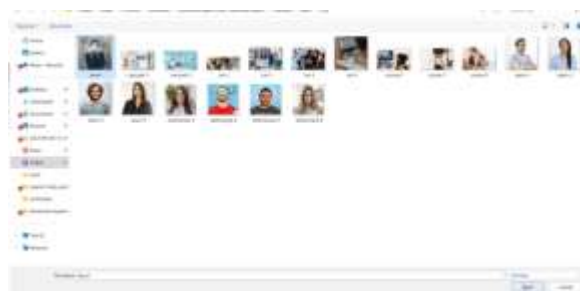
Fig 18 Upload an Input Image