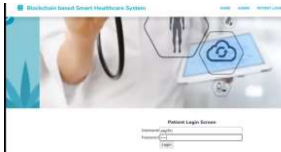
Fig 15 Patient Login Screen