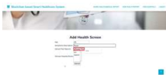
Fig 17 Add Health Screen