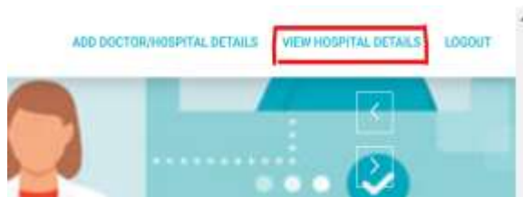
Fig 8 Click on View Hospital Details