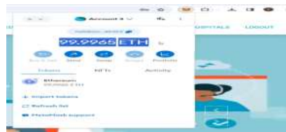
Fig 21 Metamask